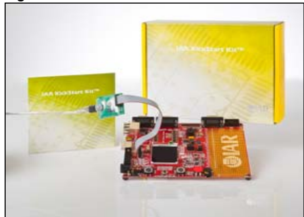
Figure 2. Starter kit

IAR KickStart kits are available for a full range of ST ARM core-based microcontrollers.