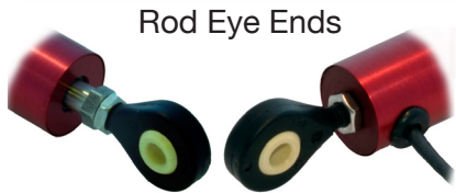
Rod Eye Ends