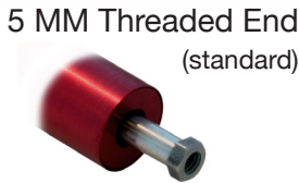
5 MM Threaded End (standard)