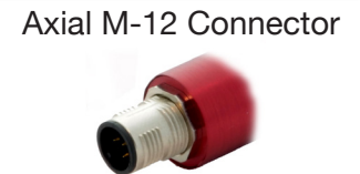
Axial M-12 Connector