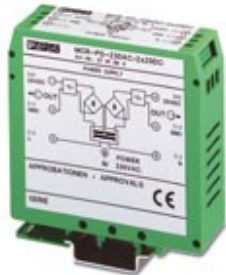
Power supply unit, with fixed-voltage regulator, input 230 V AC, output 2 x 20 V DC/2 x 25 mA

Please be informed that the data shown in this PDF Document is generated from our Online Catalog. Please find the complete data in the user's documentation. Our General Terms of Use for Downloads are valid ( http://phoenixcontact.com/download )