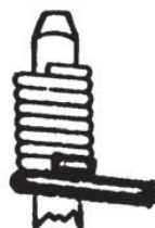
Fig. 1 Modified Wrap